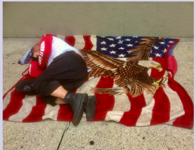
The American Dream(er) Upper West Side

N o, the flag shouldn't be on the ground. Neither should he be.